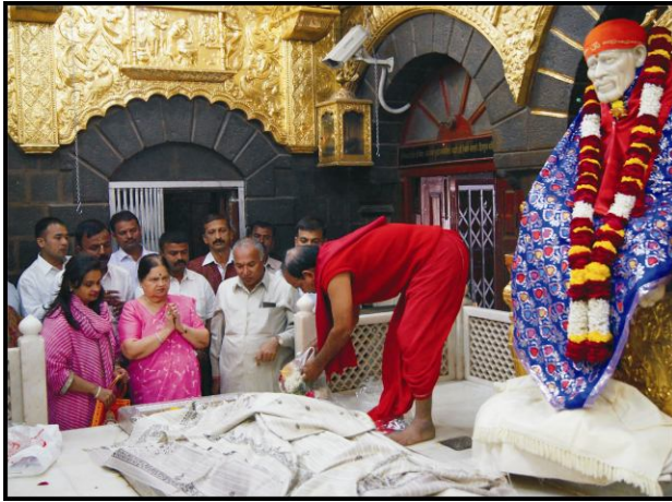
Smt.Kokilaben Ambani takes Samadhi Darshan.